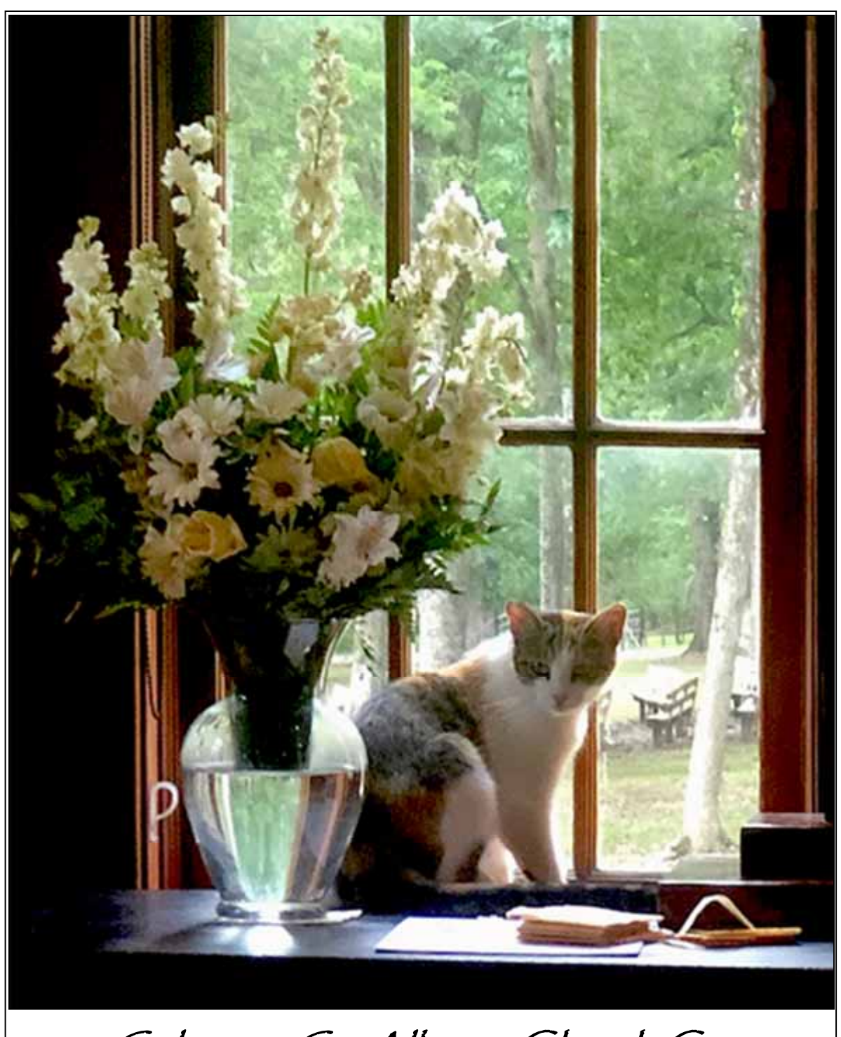
Salome ~ St. Alban's Church Cat